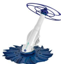
Limpiafondos automático Automatic cleaners 90397