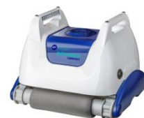
Robot Robot RKA80