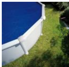
Cubierta isotérmica Isothermic cover CPROV915